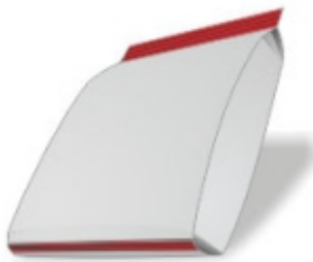
Pillow bag with flat bottom Material: BOPP (biaxially oriented polypropylene) and its variations. PE (polyethylene) and its variations.