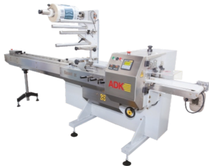
» Serie H400/H500 (S)