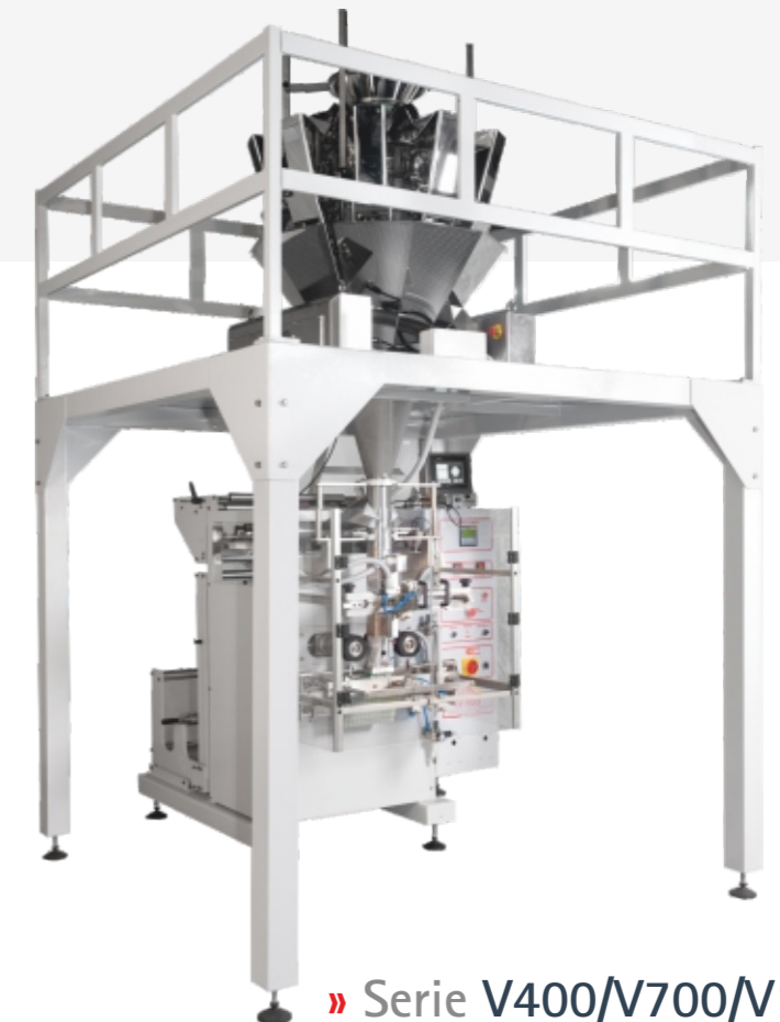
» Serie V400/V700/V1000