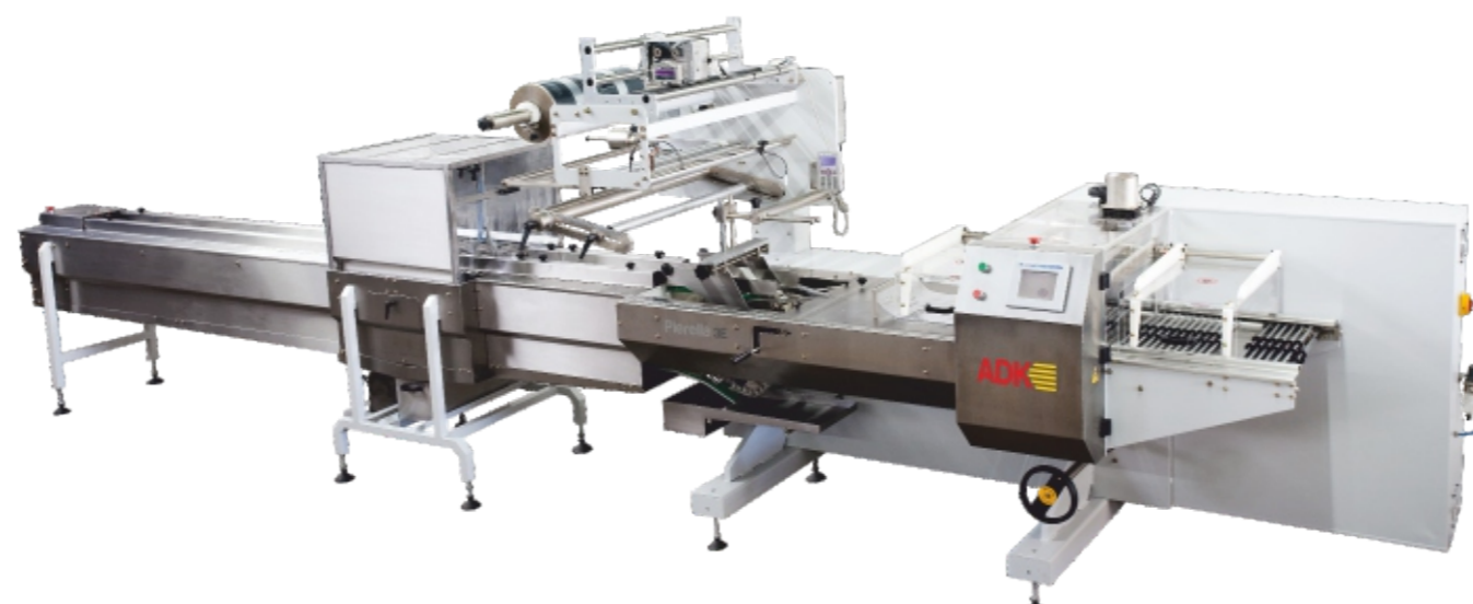
» Serie H600/H700 (S)